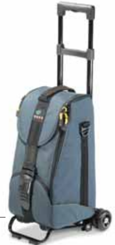
PEC - 10 with Insertrolley (not included)

KATA's Portable Editing Cases are designed to store and carry digital portable editors. They allow work to be done under a variety of field conditions while the instrument remains protected in the case. There are four carrying options; by handle, with shoulder strap, utilizing the Omega Hidden Harness System (In PEC-1 & 2 only) or using the Insertrolley (not included). The PEC-2 contains a movable, removable divider to separate compartments. PEC-1 for SONY DNW-A220-P and A 225/DSR70 – two units. PEC-10 fits one unit of the SONY DSR 70 and the SONY DNW-A25. PEC-2 for PANASONIC AJ-LT75/85/95 or PHILIPS DCR-75/85