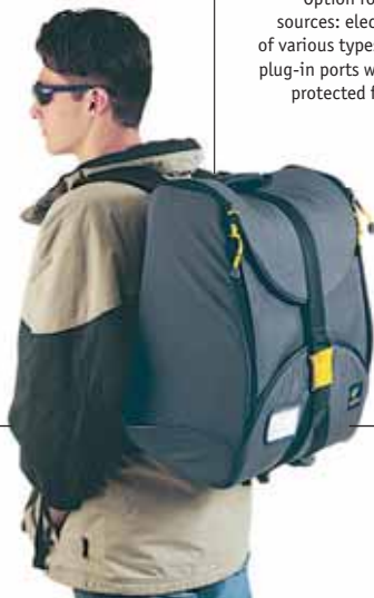
PEC - 1 & PEC-2 backpack option

Option for diverse energy sources: electric cable, batteries of various types. Access to connector plug-in ports while the instrument is protected from dirt and dust