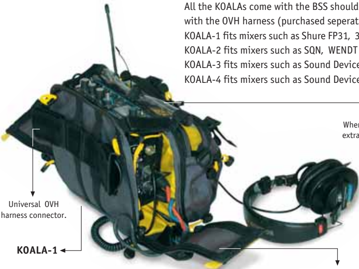
Universal OVH harness connector.

Audio professionals can enjoy our quality and style with the KOALA mixer pouches. The KOALAs are designed to help organize essential sound equipment while keeping it conveniently close at hand. In KOALA's mixer and wireless compartments, cables stay tangle free. Just stow them in the storage area in the bottom of the case and feed them through handy connection ports. All the KOALAs come with the BSS shoulder strap included, and can be used with the OVH harness (purchased separately). KOALA-1 fits mixers such as Shure FP31, 32, 32A, 33 or other 3 channel mixers. KOALA-2 fits mixers such as SQN, WENDT or other 4 channel mixers. KOALA-3 fits mixers such as Sound Devices 442 or other 3 - 4 channel mixers. KOALA-4 fits mixers such as Sound Devices 302 or other 2 - 3 channel mixers.