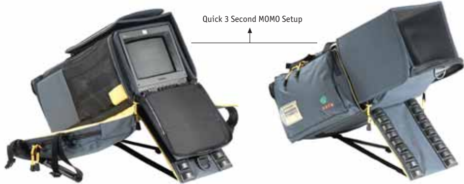
Quick 3 Second MOMO Setup