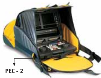
PEC - 2