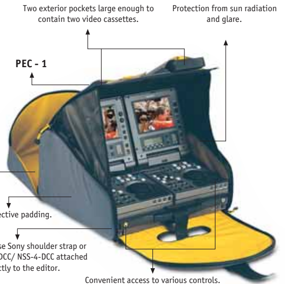
Two exterior pockets large enough to contain two video cassettes.

Option for diverse energy sources: electric cable, batteries of various types. Access to connector plug-in ports while the instrument is protected from dirt and dust